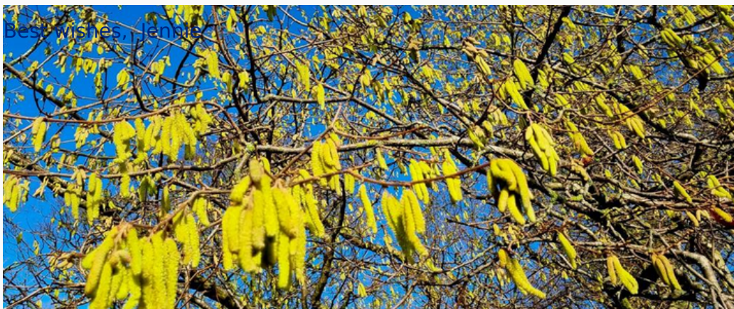
Images from top down: A snowy Garden of Remembrance Snowdrops emerge Ducks on Ice Left: The beautiful Catkins