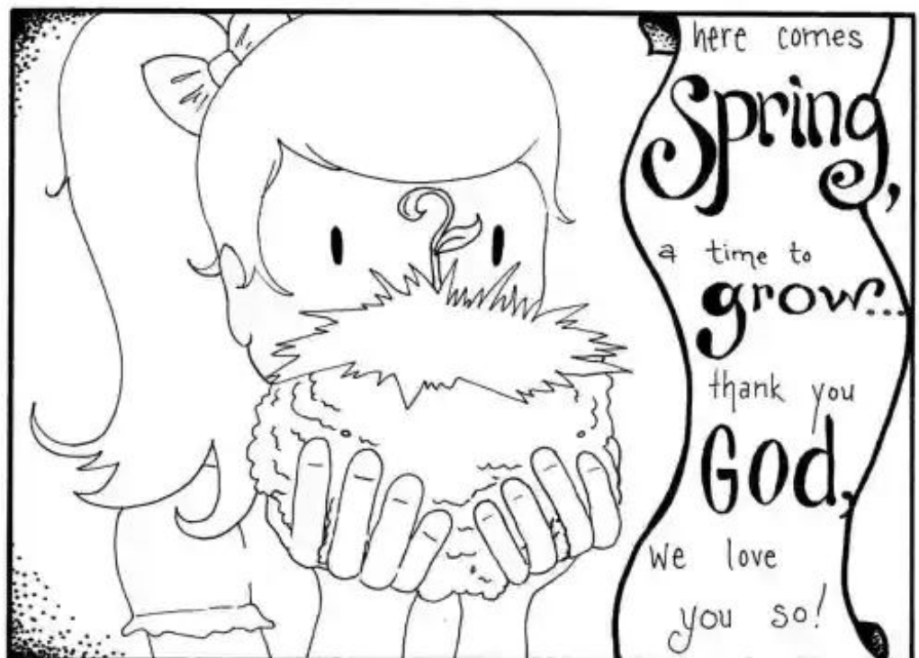
Mandy Grace '10

Signs of Spring are everywhere, so here's a colouring picture to celebrate. In our word search, try and find the hidden Bible names - there are 20 in all.