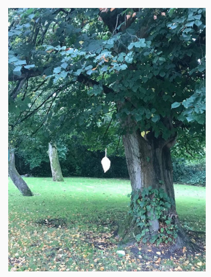
A spinning leaf on a spider's web