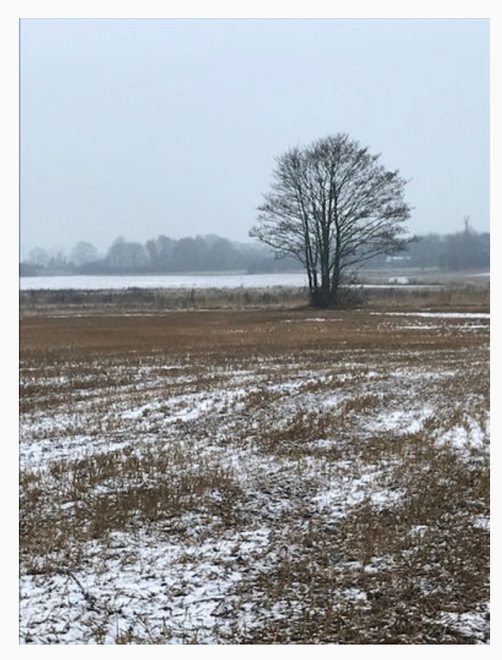
A snowy day across Ecclesfield