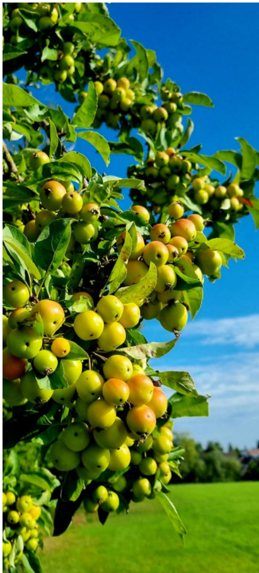
All images courtesy of Mike Horton